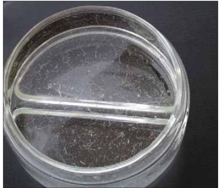
Figure 6. Worms flushed from an SDI system. Flushing twice a week solved the problem.

Back-siphoning is the backflow of water from the soil profile back into the tape at the end of an irrigation cycle. It is caused by a vacuum that develops as residual water in the tape moves to the lower elevations in the field. Back-siphoning may pull soil particles and other debris through emitters and into the tape. Figure 6 shows some live worms that were flushed from SDI lines during normal maintenance. It is thought that the eggs or cocoons of worms were pulled into the drip lines at the higher elevations in the field when zone valves were closed. Once in the drip lines, the eggs hatched and the worms started to grow. Worms and other contaminants were removed during normal flushing cycles (every 2 weeks).