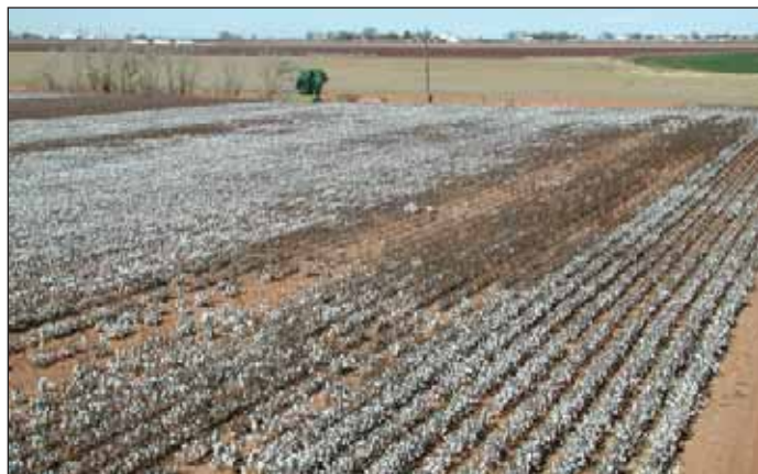
Figure 3. (Top) Plants in this field are drought-stressed because emitters are clogged. (Bottom) Acid injection can reduce clogging problems so fields are irrigated uniformly.