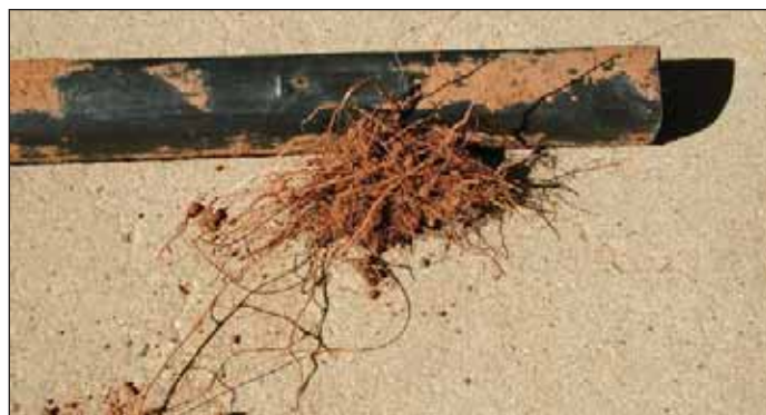
Figure 5. Roots penetrating a drip emitter.

It is important to keep plant roots from penetrating the drip emitters (Fig. 5 shows a root intrusion problem). Metam sodium and trifluralin are two compounds that control roots. In cotton, metam sodium is generally used at defoliation to keep roots out as the soil dries,