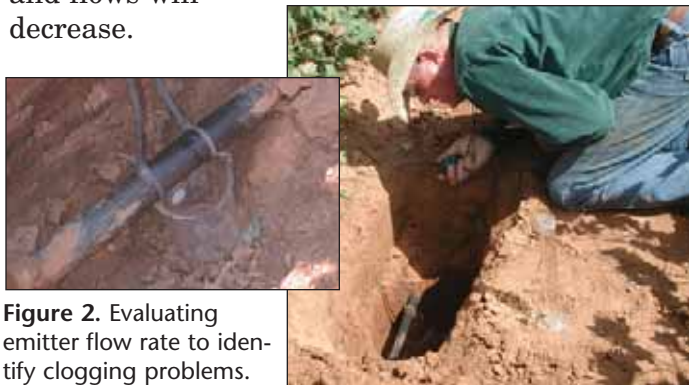
Figure 2. Evaluating emitter flow rate to identify clogging problems.

One way to evaluate clogging problems is to place a container under selected emitters as shown in Figure 2. The emitter flow rate (volume over time) collected at different locations should be compared against the design flow rate. The upper picture of Figure 3 shows a field where plants are stressed because emitters are clogged by manganese oxides. The general condition of a drip system can be easily evaluated by checking system pressures and flow rates often. If emitters become plugged, system pressures will increase and flows will decrease.