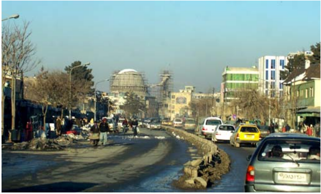
Traffic in Kabul isn't too bad this morning. We quickly reach the east side of the Kabul River, passing the lumber yards, autopart stores and other shops on the edge of town.